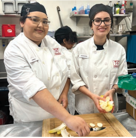
Drummond Culinary Academy students employ their superior knife skills on bananas.

The Community Project Funding initiative enables members of Congress to advocate for specific projects that directly benefit their districts. It's a significant step in supporting local communities.