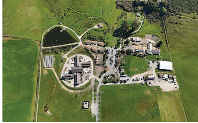
Rancho Cielo’s first group of TRUST certification recipients. Drone footage shot of the Rancho Cielo campus.

Drones have revolutionized the agricultural industry by enabling farmers to monitor large areas of crops, conduct precision fertilizer and pesticide spraying, map land, manage livestock and analyze soil. Real-time data on crop health helps farmers identify areas that need attention, optimize resource allocation and increase efficiency and yield. The Ag Technology & Mechatronics program at Rancho Cielo was an obvious choice for students looking to learn about drones and their future in the agricultural sector. Drone operation is not just about knowing how to fly them; it also requires a license. All recreational flyers must pass an aeronautical knowledge and safety test called The Recreational UAS Safety Test (TRUST). This test ensures an understanding of airspace regulations, safety guidelines and operational limitations.