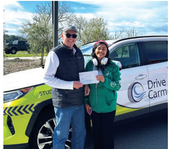
Through a partnership, Drive Carmel brings driver’s education to Rancho Cielo. A student shows off her recently acquired learner’s permit.

Every student who’s participated in Rancho Cielo’s driver’s ed program since its spring of 2022 inception, is dedicated and has shown up every day. Obtaining a driver’s license in California is costly and no longer a standard offering in public schools, so students benefit significantly. A driver’s license symbolizes equity, inclusion and independence. Additionally, it broadens employment opportunities for our students and paves the way for personal growth and responsibility. Of the 78 who have taken the course so far, 67 have earned their driver’s permits and 34 have obtained driver’s